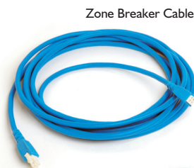
Zone Breaker Cable