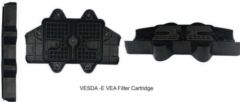
VESDA -E VEA Filter Cartridge

VESDA-E detectors have field replaceable parts, one of which is the filter, VEP/VEU/VES filter part no. VSP-962, VEA filter part no. VSP-972.